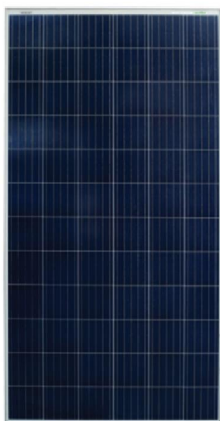
Front View of Different Sizes 72 Cells Module Series

Modules binned by current to improve system performance